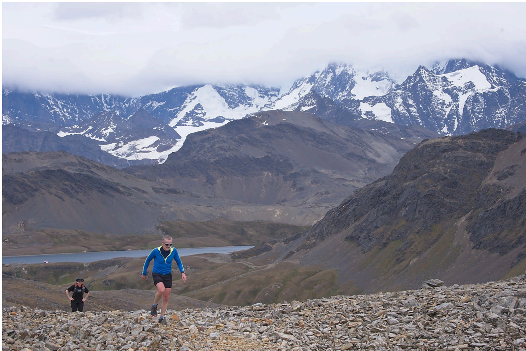
2025 South Georgia Half Marathon

There are usually a number of people who come in for the summer for various projects and the time on base varies. Some of these are BAS and some are from other organisations. They may have some time on base and some time in the field. They are usually accommodated in Discovery House and cook for themselves. Again, we usually extend an invitation to them for Saturday night dinners. Some people who come in for the summer have been down many times and have fascinating stories to tell of the island.