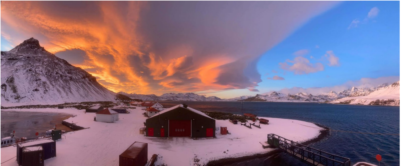
KEP "Main Street" viewed from on board a vessel. This will be where you arrive to.

KEP is different from the other British Antarctic Survey stations because it isn't just a BAS base. In fact BAS manage the station on behalf of South Georgia Government and that means that there are plenty of non-BAS people living and working here.