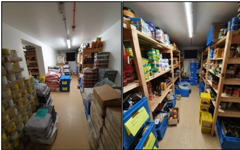
Well-stocked KEP food stores

Most of our food arrives at first call around December time. There is very little we actually have to do without. Our dry food store is well stocked with pantry items and the freezers hold a good range of meat, dairy products (except milk, which comes in powdered) and frozen veg. There is a good supply of none dairy milks. We get pretty regular deliveries of fresh(ish) vegetables from the Falkland Islands too. Luxury items such as crisps and chocolate are in shorter supply and rationed. You won't go hungry and will no doubt discover a whole new range of culinary ideas. Vegetarians/Vegans are well catered for too. If cooking isn't your thing – do not worry! It really will be fine.