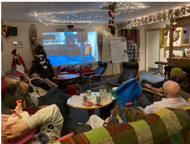
Social events in the Everson Bar/Living room