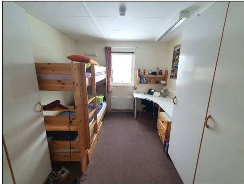
A typical KEP pitroom with bunks, desk, cupboards and en-suite shower & toilet. Over winter you will normally have a room to yourself.