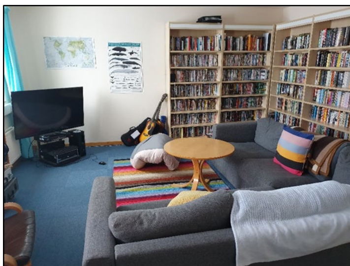
Screen 2 has a good supply of DVDs and books.

There is an extensive selection of books, music, movies and TV programmes on station and you'll never be short of something new to discover. However new additions, especially new releases, are always welcome. We get regular releases of a range of magazines, though all a year behind their publishing date. New reading material is popular at smoko. There are plenty of board games to choose from, including Catan and its expansion packs!