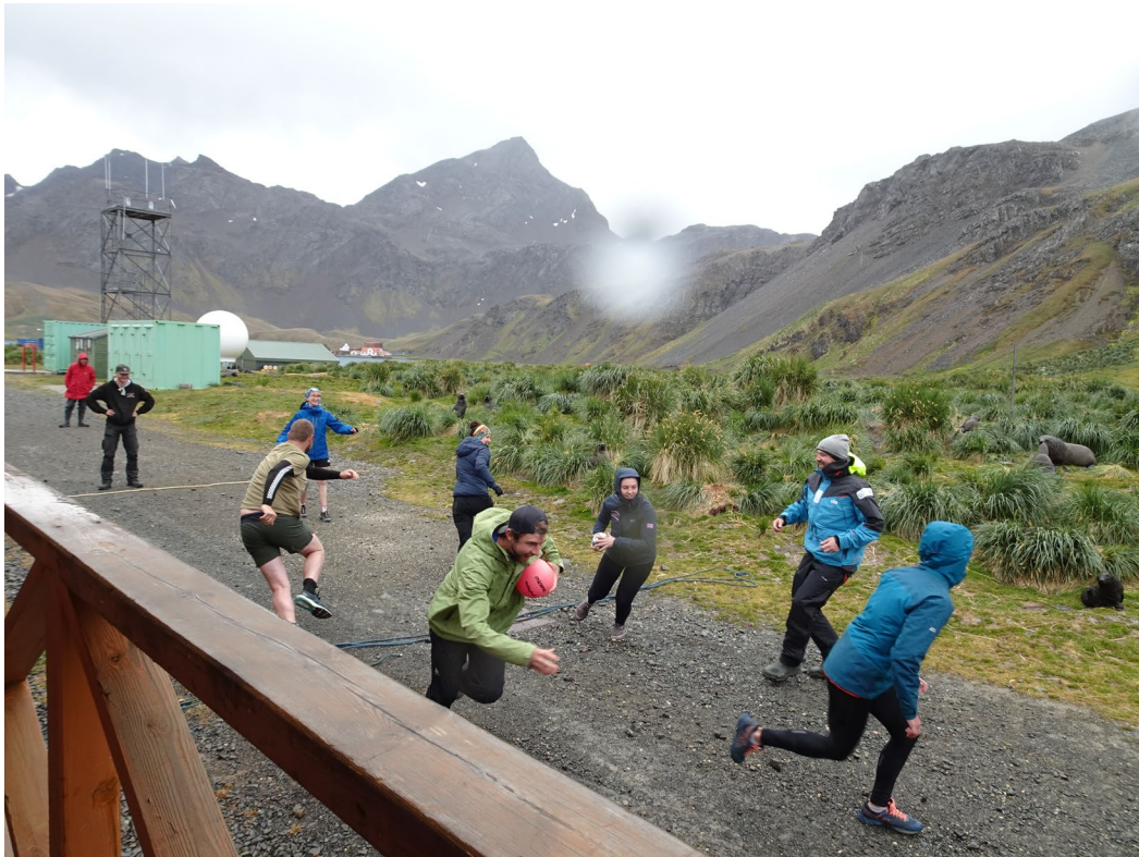
Summer Olympics - Dodge Ball?!