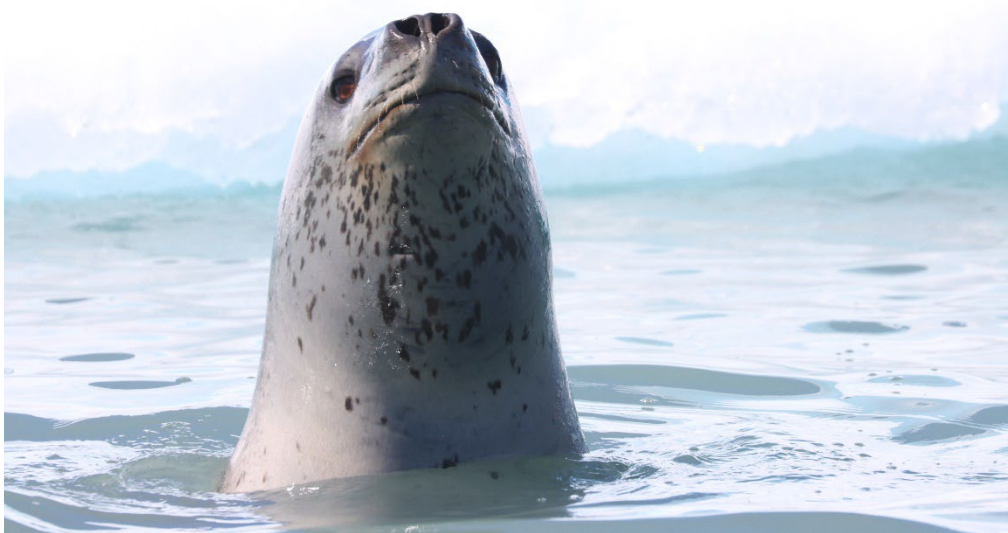
Leopard Seal by an ice berg

The scenery and wildlife at South Georgia are spectacular. Many people spend a lot of money on a variety of cameras and it's common to wish they'd brought more rather than less, however there is no need to go crazy and spend excessive amounts.