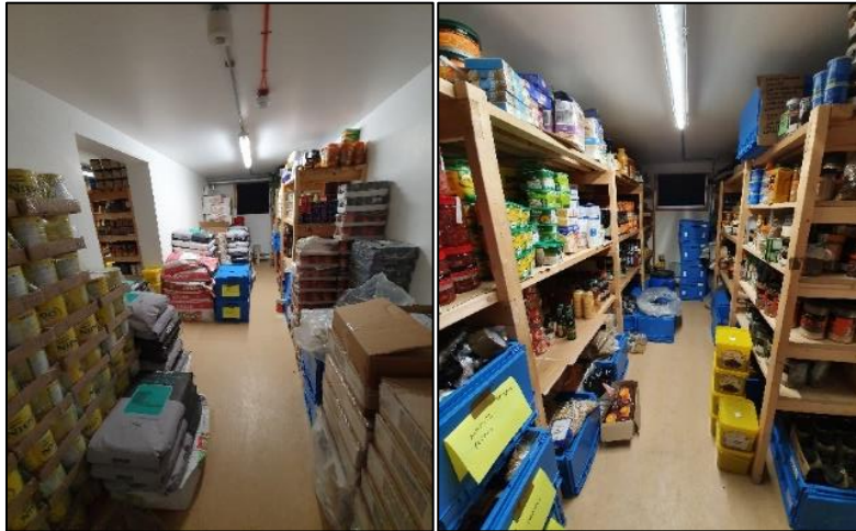
KEP has a well-stocked food store!