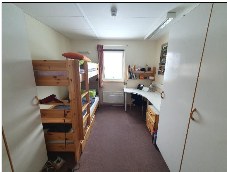
A typical KEP pitroom. Over Winter you will normally have a room to yourself.