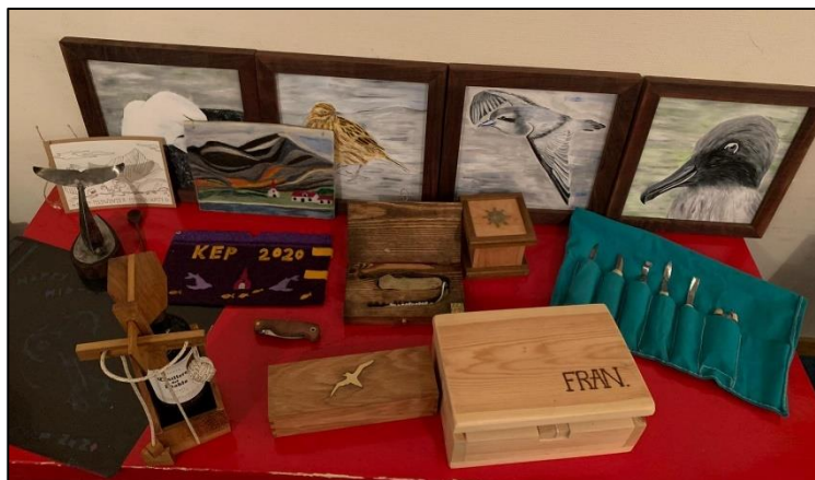
The 2020 Mid-Winter Gifts

Painting, knitting, woodwork, glass etching... the list of craft projects people have embarked on is long and diverse. Supplies on station are limited so make sure to pack anything you think you want to experiment with. One of the highlights of midwinter week is the exchange of gifts; there are some real gems of hand-crafted beauty created over the preceding month or two, often by people who never thought they could accomplish anything so complex. Specialist bits and pieces may be worth bringing down; clock mechanisms, mirrors, hinges etc.