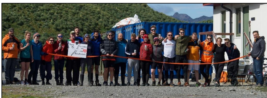
Walkers, Runklers and Runners for the 2019 South Georgia Half Marathon