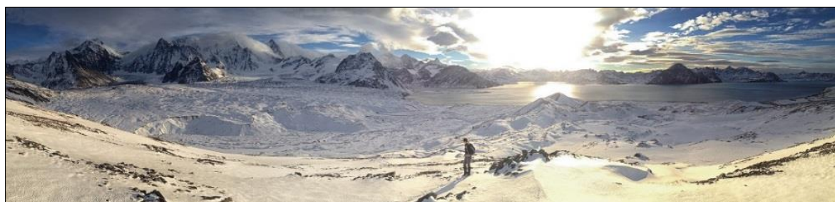
Snowy day towards Harpon and the Lyell Glacier

The scenery and wildlife at South Georgia are spectacular. Many people spend a lot of money on a variety of cameras and it's common to wish they'd brought more rather than less, however there is no need to go crazy and spend excessive amounts.