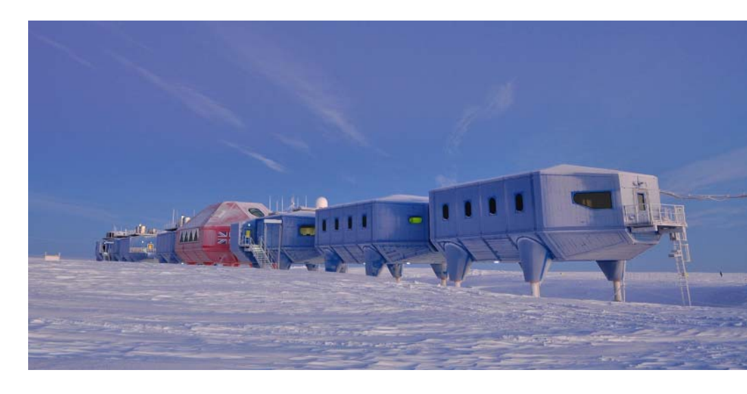
Image: Top: Location of BAS offices and research stations. Bottom: Halley VI Research Station on the Brunt Ice Shelf.

In 2006, BAS commissioned a new research station to replace the previous Halley station (Halley V), located on the floating Brunt Ice Shelf. A competition was held to choose the best design for Halley VI with the winning scheme featuring a new modular station, elevated on ski-equipped, jackable legs to avoid burial by snow. This state-of-the-art science facility was opened in 2012.